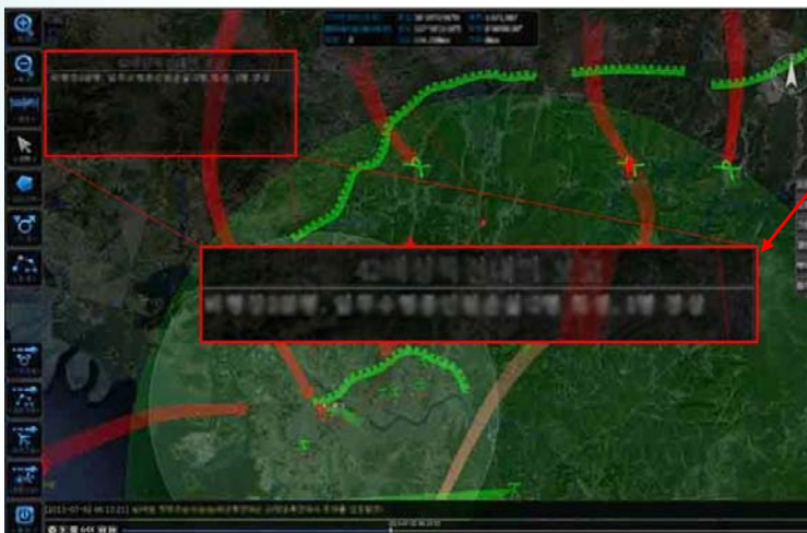
Korean characters blurred