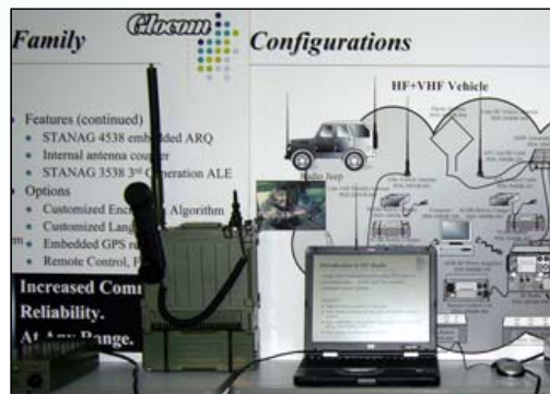
Materiel presented at the Glocom DSA booth