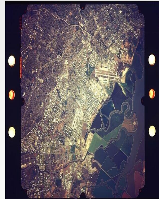
Satellite View of Silicon Valley (NASA)