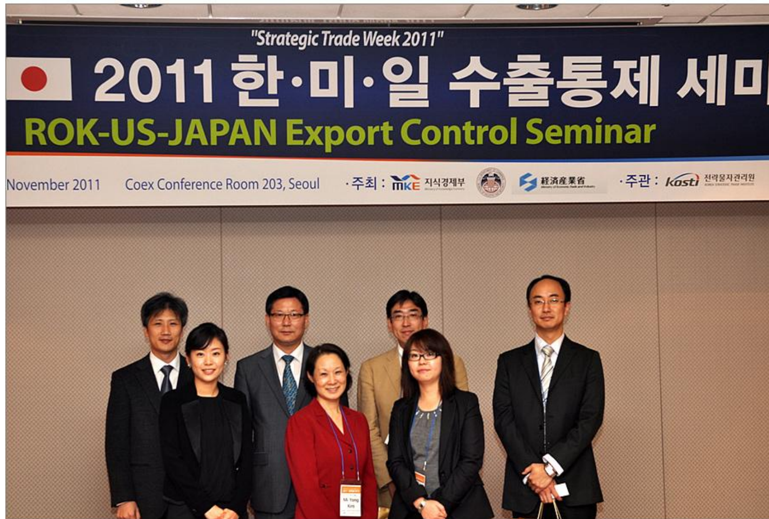
2011.11.8 한미일 수출통제 세미나