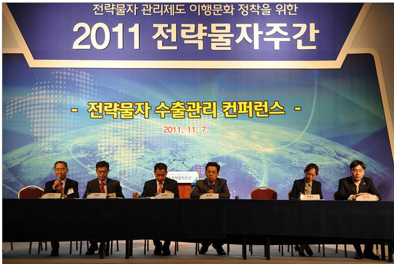
2011.11.7 전략물자주간 개막식 및 컨퍼런스