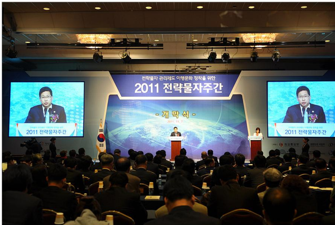
2011.11.7 전략물자주간 개막식 및 컨퍼런스