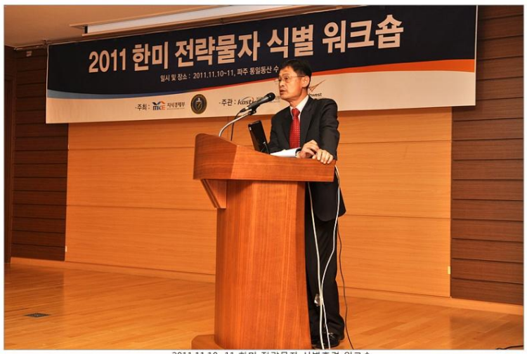
2011.11.10~11 한미 전략물자 식별훈련 워크숍