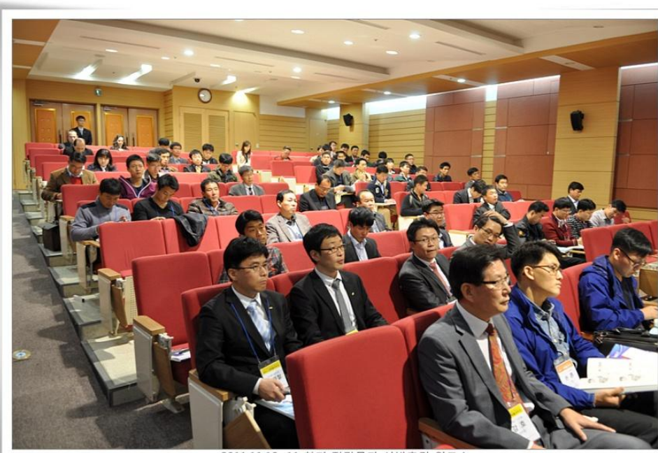
2011.11.10~11 한미 전략물자 식별훈련 워크숍