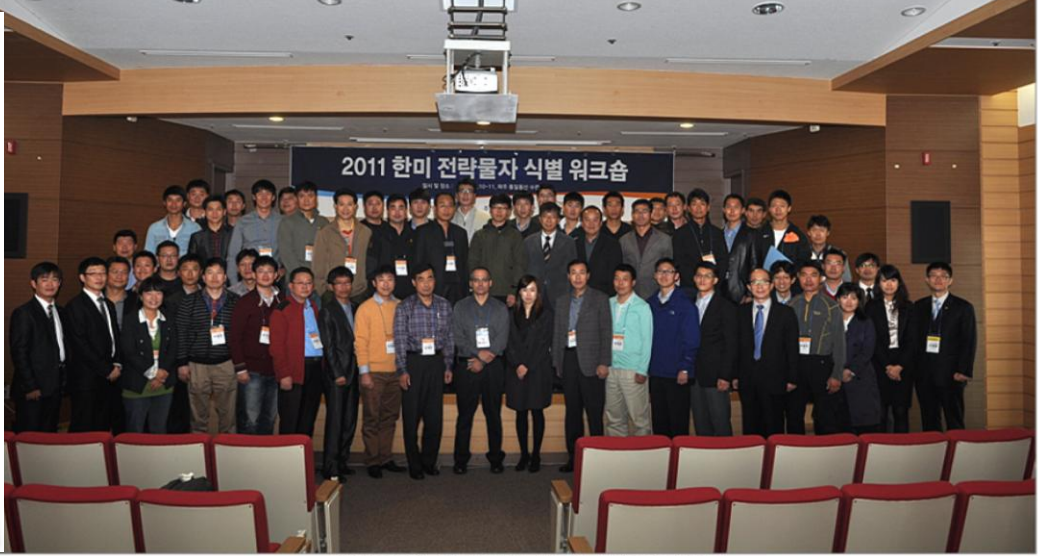
2011.11.10~11 한미 전략물자 식별훈련 워크숍