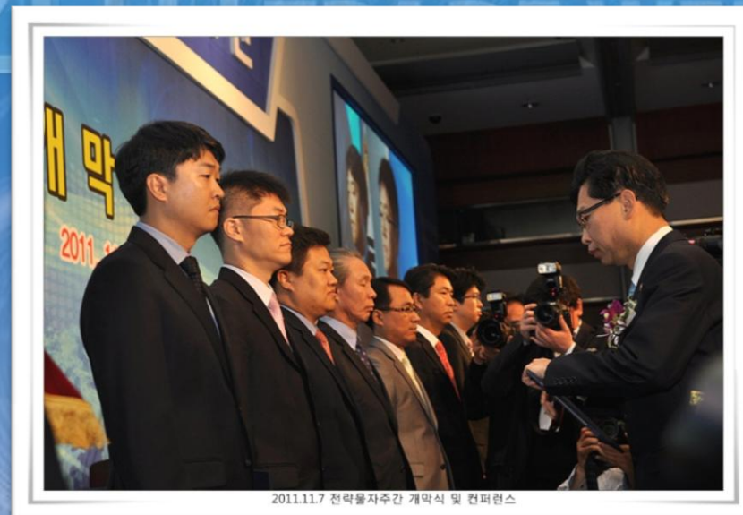
2011.11.7 전략물자주간 개막식 및 컨퍼런스